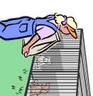
hutch – for rabbits (Stall)